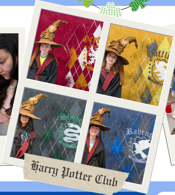
Harry Potter Club