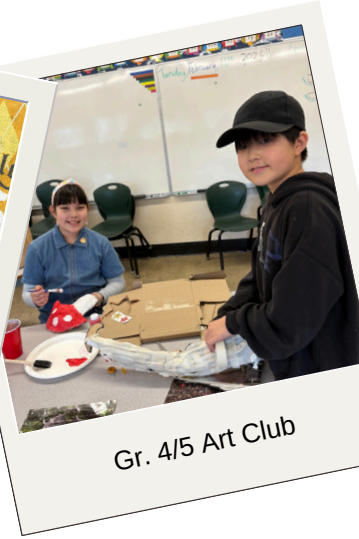
Gr. 4/5 Art Club