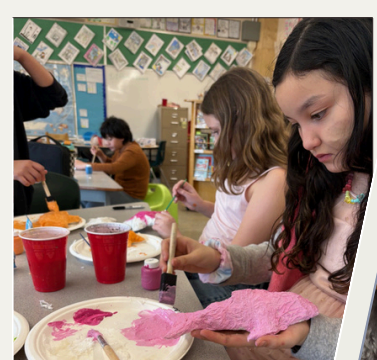
Gr. 4/5 Art Club