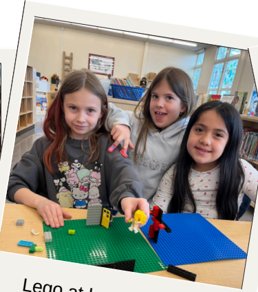
Lego at Lunch Recess