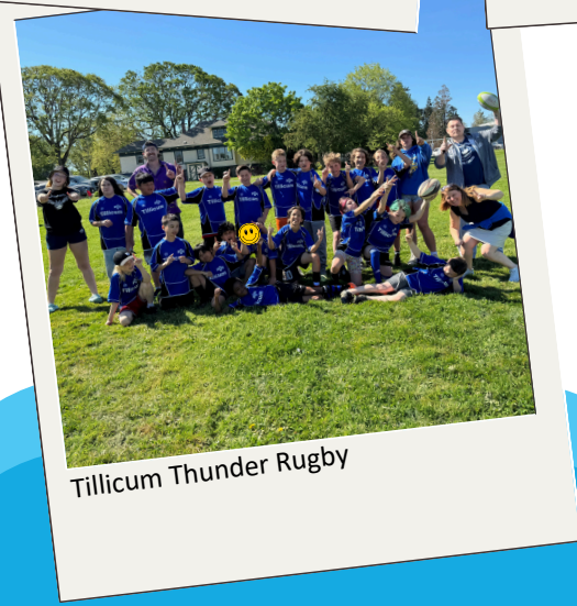
Tillicum Thunder Rugby