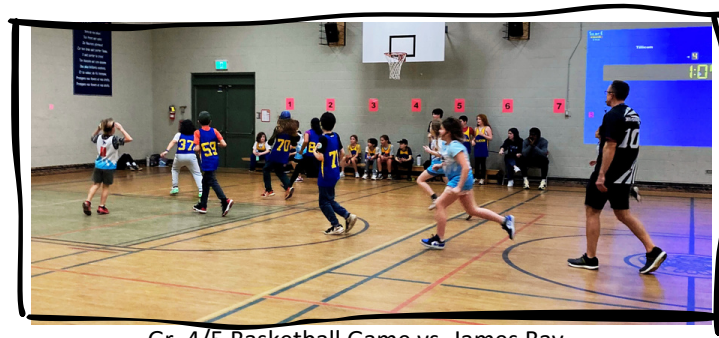
Gr. 4/5 Basketball Game vs. James Bay